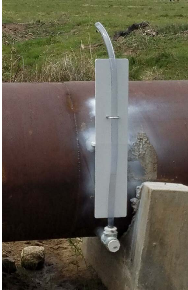
Cottonwood Ramp Flume Stilling Well