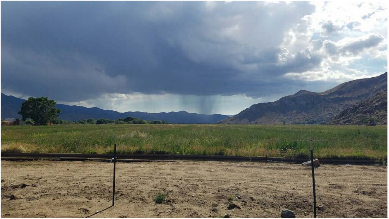
Spring Thunder Storms